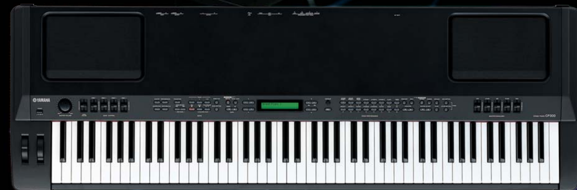
STAGE PIANO CP300

Drawing on our rich tradition and experience, these instruments give the live performer all the sound and expressiveness of a superbly mic’d grand piano with the portability and versatility of a modern digital instrument. Introducing the new standard in stage pianos—the CP series.