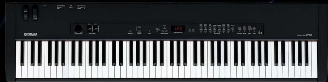
STAGE PIANO CP33